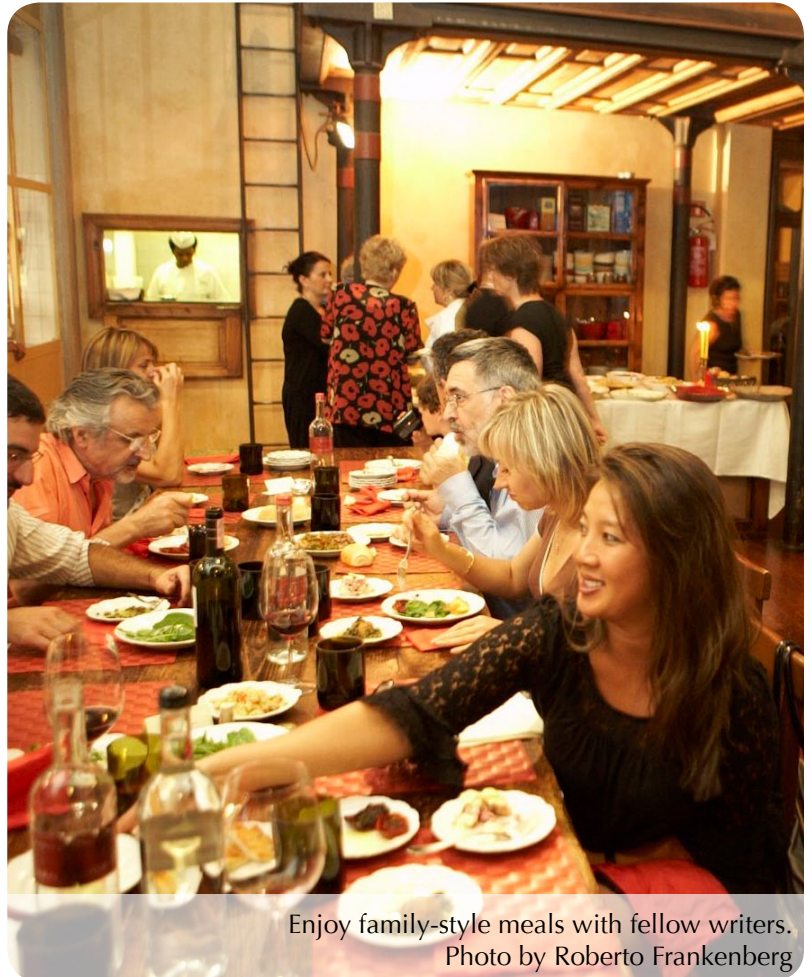
Enjoy family-style meals with fellow writers.

A nonrefundable deposit of $450 for Session, $1,000 for Session + Lodging is due upon acceptance